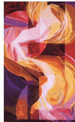
Kate Fitzgerald's "Mystic" from the "Wandering Eye" exhibit at Image City.